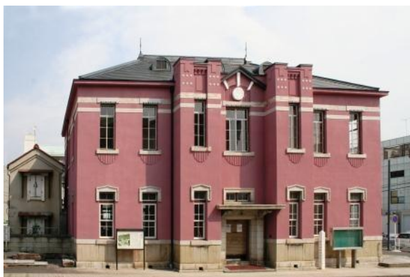
Kiryu Orimono Kinenkan

Toyoko Inn Kiryu-eki Minami-guchi (The meeting place, 10:00) = 杖 = Kiryu Club = 杖 = Kamanaru-lane (Kanamaru-komichi) = 杖 = MATSUI KNITTING CRAFTS MFG., LTD. = 杖 = Yurinkan (Former Yano Warehouses)/Yanoen (Yano Co., Ltd)=Gunma University Faculty of Engineering Commemoration Hall [Lunch time]= 杖 = The Kiryu Tenman-gu Shrine precincts = 杖 = Yotsuji No Saika = 杖 = Shinmachi, Kiryu important traditional buildings preservation district = 杖 = Isamiya rice cracker = 杖 = Miwa Shrine = 杖 = Kiryu Orimono Kinenkan (Kiryu Textile Union Memorial Hall) = Tourism and Souvenirs Center Watarase = 杖 = Toyoko Inn Kiryu-eki Minami-guchi (Breakup)